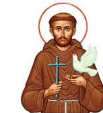
Men's Bible Study

Check out our new St. Francis of Assisi promo items displayed in our dining area. There are some great ideas for summer time gifts and t-shirts at great prices! Let's show how proud we are of our little church on the prairie! *All items will have a St. Francis of Assisi Logo on it!